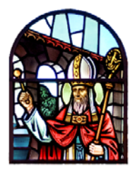
St. Boniface Martyr Parish Sea Cliff, NY June 27, 2007