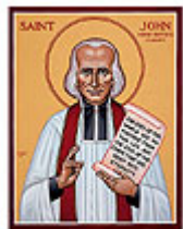
Cure of Ars Parish Merrick, NY June 24, 1992