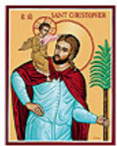
St. Christopher Parish Baldwin, NY June 17, 1987

The Parishioners of St. Boniface Martyr Church, Sea Cliff joyfully invite you to a celebration of the 25th Anniversary of the Ordination to the Priesthood of Jesus Christ of their Pastor,