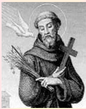
St. Peter of Alcantara Parish Port Washington, NY June 26, 2002