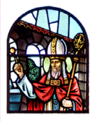
St. Boniface Martyr Parish Sea Cliff, NY June 27, 2007