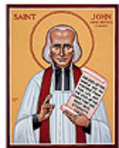
Cure of Ars Parish Merrick, NY June 24, 1992