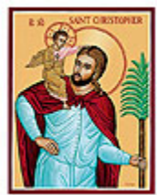
St. Christopher Parish Baldwin, NY June 17, 1987

The Parishioners of St. Boniface Martyr Church, Sea Cliff joyfully invite you to a celebration of the 25th Anniversary of the Ordination to the Priesthood of Jesus Christ of their Pastor,