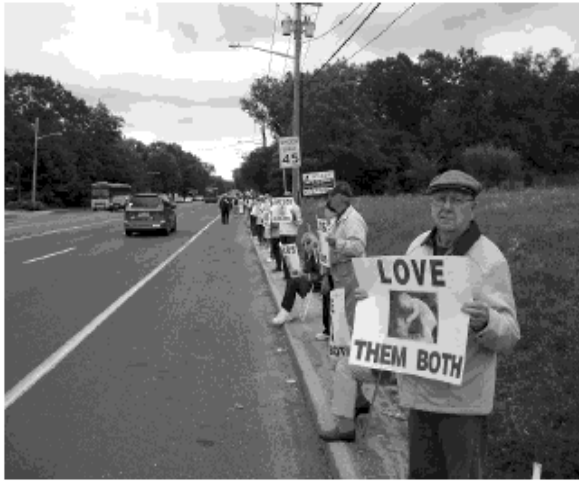
Signs will be distributed at both locations.

ALL WELCOME! 2012 GOAL: 1200 Participants