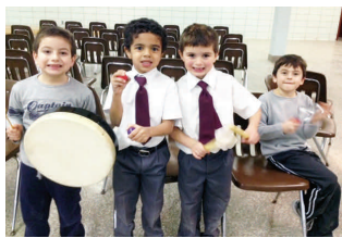
Students wait to greet the Dragon Parade! with a lot of noise