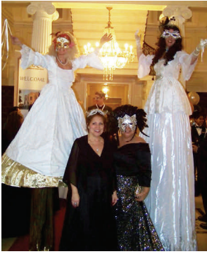
At the Headmaster's Ball!

Our Parish's Catholic school recently continued a gala tradition by celebrating the 2nd Annual Headmaster's Ball. The Venetian Masquerade themed ball took place at the Glen Cove Mansion. Several local families