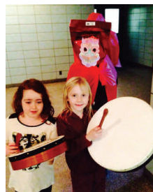
Here comes the dragon!!