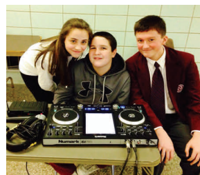
Members of middle school DJ Club provide music for Fun Friday Parties.

nese New Year, St. Patrick's Day, Earth Day, Cinco de Mayo and the Feast of St. Anthony.