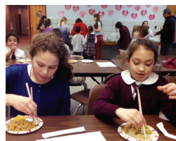
Enjoying a traditional meal.

During the party, the children learned many things about the Lunar New Year.