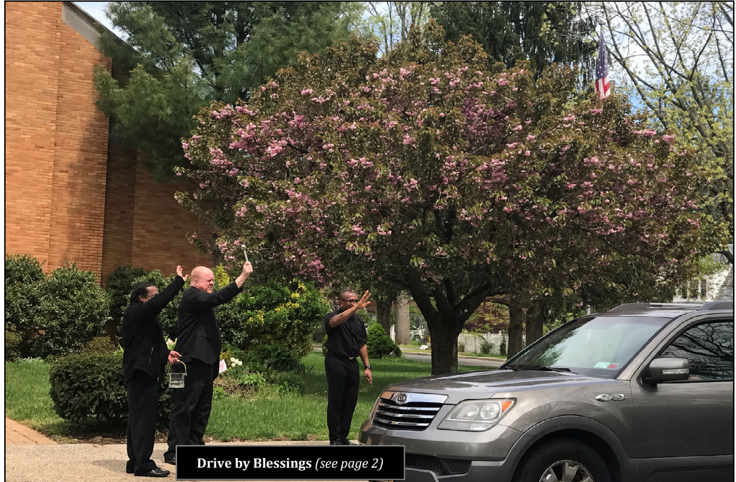
Drive by Blessings (see page 2)