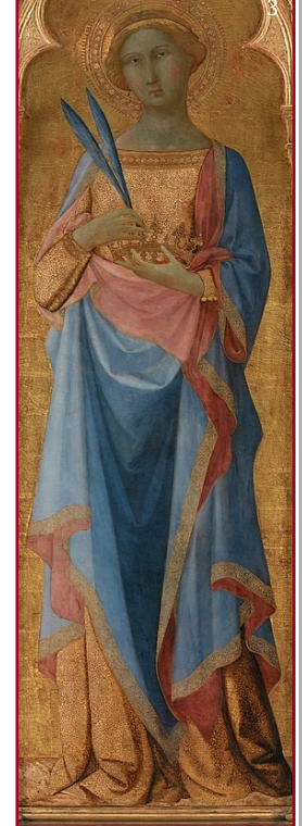
St. Corona altarpiece, c. 1350

Jesus, I trust in You. Amen. -Copyright © 2020 My Catholic Life! Inc. All rights reserved. Used with permission. www.mycatholic.life