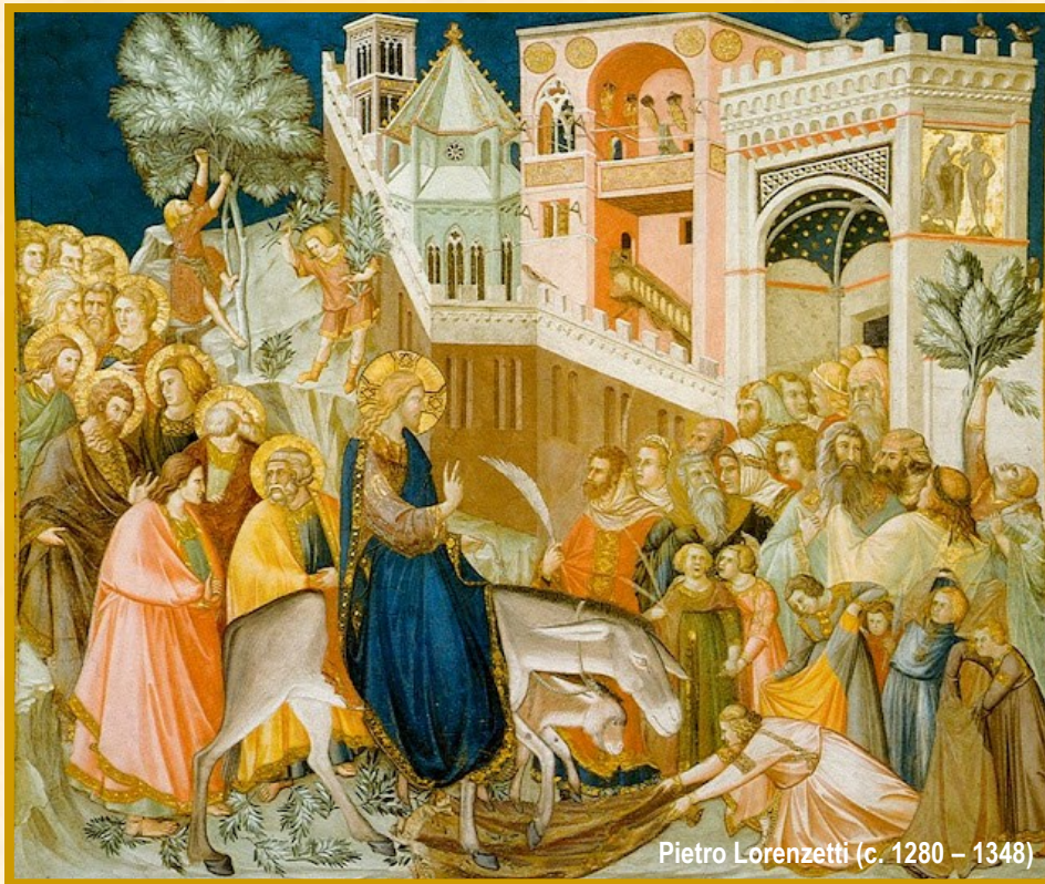
Pietro Lorenzetti (c. 1280 – 1348)

145 Glen Ave. Sea Cliff, NY 11579 Phone: 516-676-0676 Fax: 516-674-6742 Email: stbonchurch@gmail.com Website: www.saintboniface.org www.facebook.com/StBonifaceMartyr/