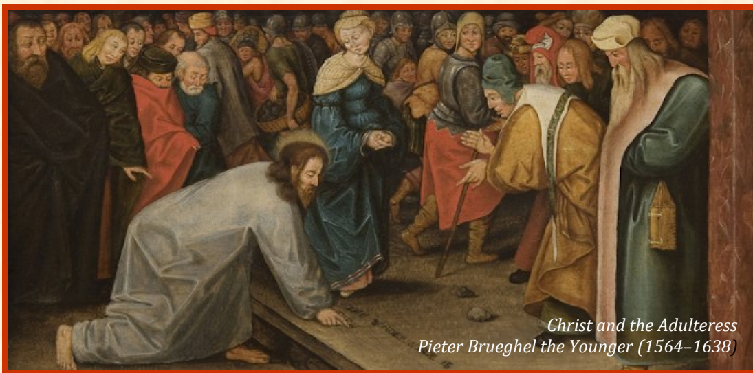
Christ and the Adulteress Pieter Brueghel the Younger (1564–1638)