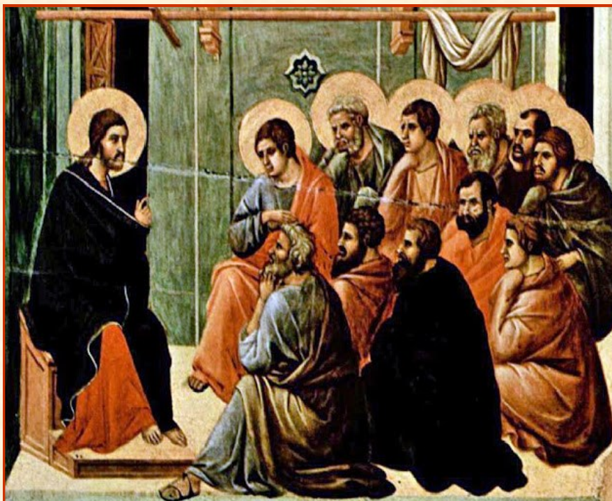
Jesus gives Farewell Discourse to disciples after the Last Supper