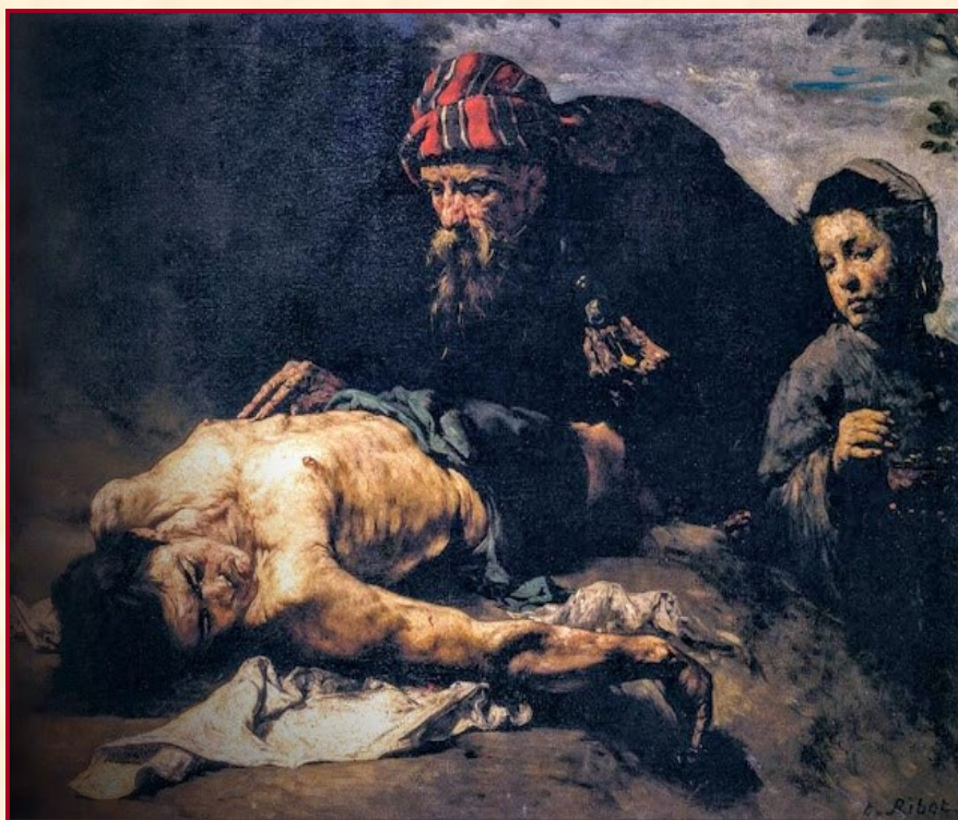
The Good Samaritan, by Augustin Théodule Ribot (1823–1891)

145 Glen Avenue, Sea Cliff, NY 11579 Phone: 516-676-0676; Fax: 516-674-6742 Email: stbonchurch@gmail.com Website: www.saintboniface.org www.facebook.com/StBonifaceMartyr/