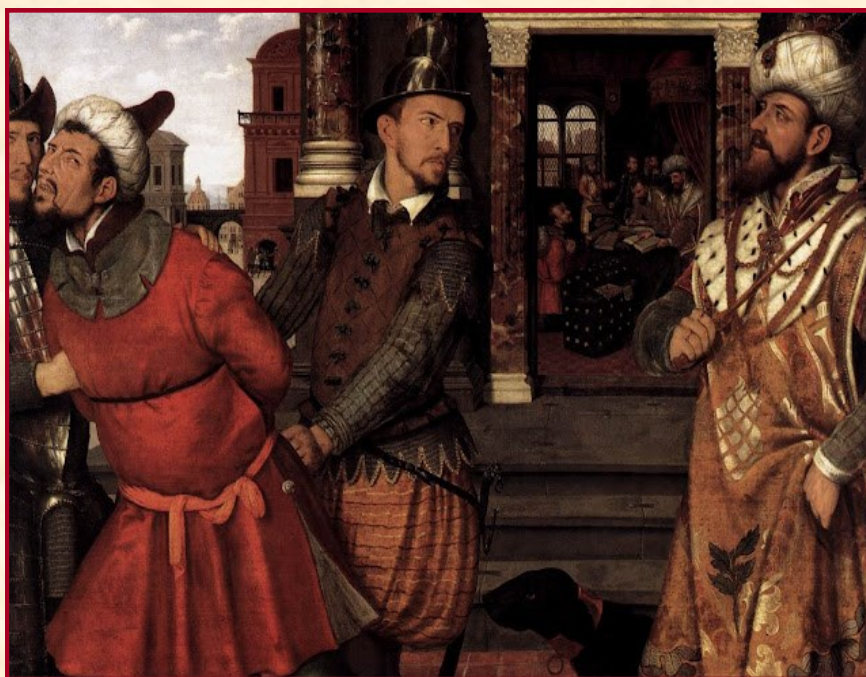
Parable of the Unfaithful Servant.

145 Glen Avenue, Sea Cliff, NY 11579 Phone: 516-676-0676; Fax: 516-674-6742 Email: stbonchurch@gmail.com Website: www.saintboniface.org www.facebook.com/StBonifaceMartyr/