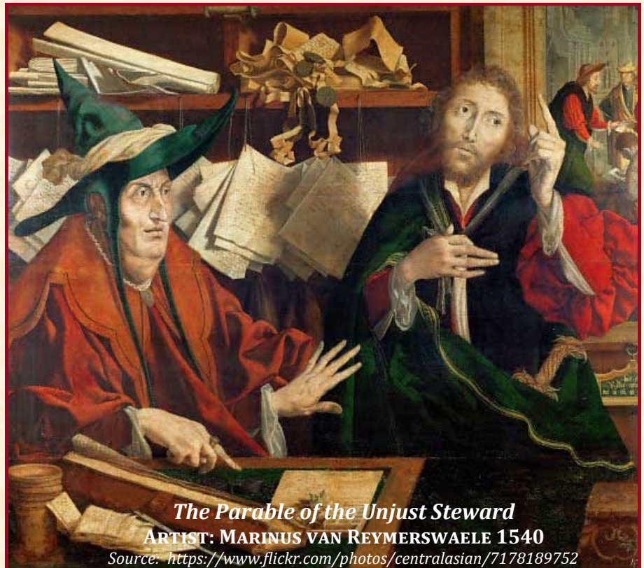
The Parable of the Unjust Steward

145 Glen Avenue, Sea Cliff, NY 11579 Phone: 516-676-0676; Fax: 516-674-6742 Email: stbonchurch@gmail.com Website: www.saintboniface.org www.facebook.com/StBonifaceMartyr/