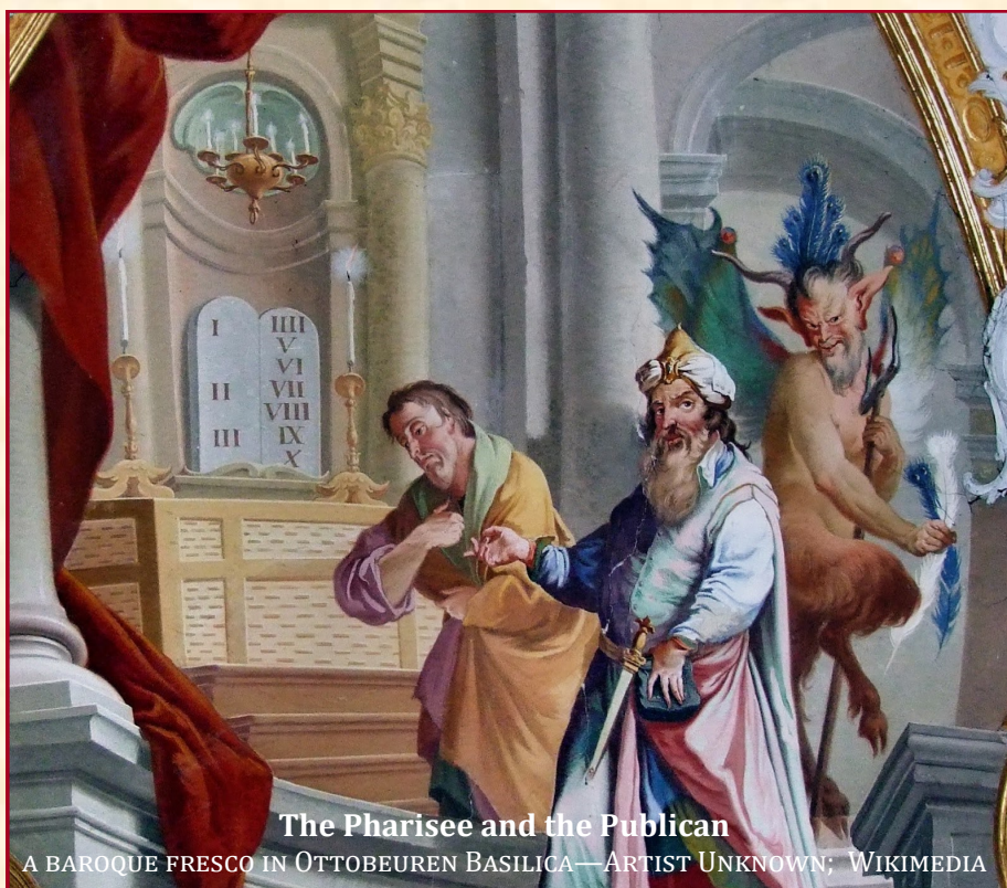
The Pharisee and the Publican

A BAROQUE FRESCO IN OTTOBEUREN BASILICA