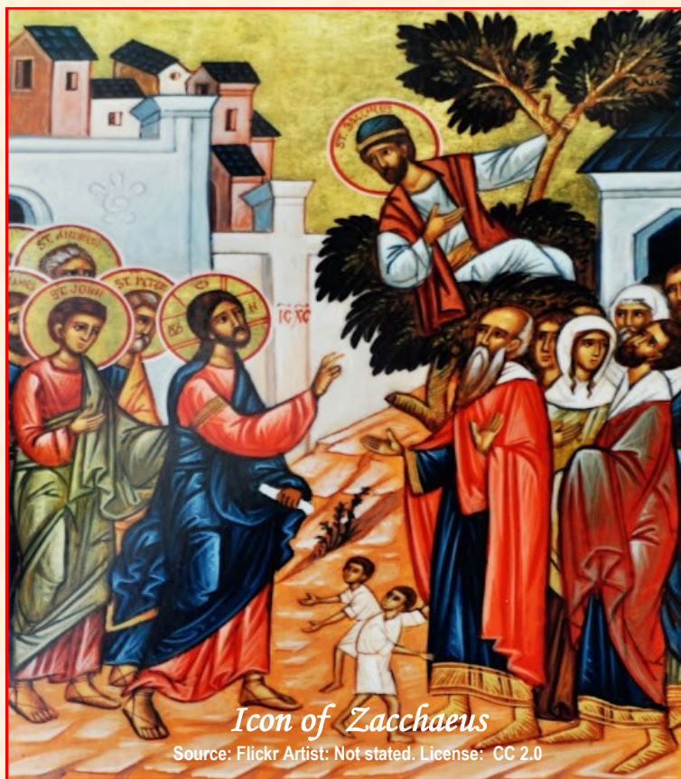
Icon of Zacchaeus

Source: Flickr Artist: Not stated. License: CC 2.0