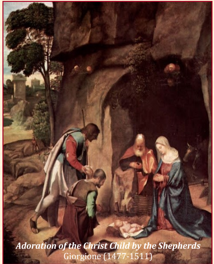
Adoration of the Christ Child by the Shepherds Giorgione (1477-1511)