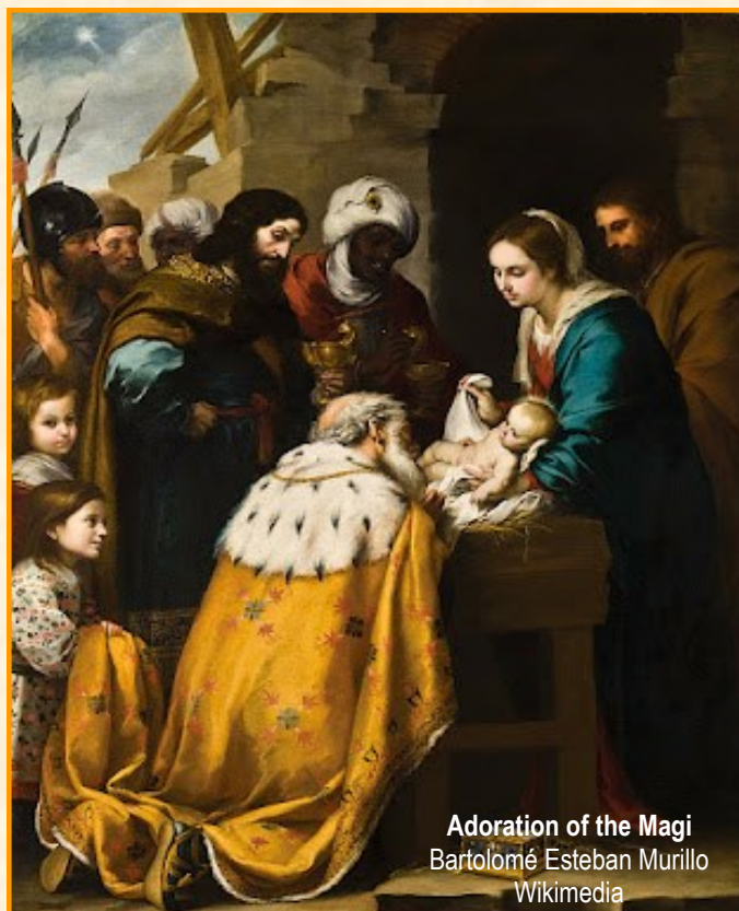
Adoration of the Magi Bartolomé Esteban Murillo