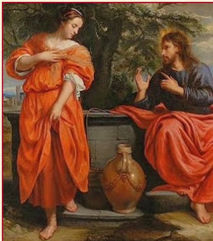
Jesus and the Samaritan Woman

145 Glen Avenue, Sea Cliff, NY 11579 516-676-0676; stbonchurch@gmail.com www.saintboniface.org www.facebook.com/StBonifaceMartyr/