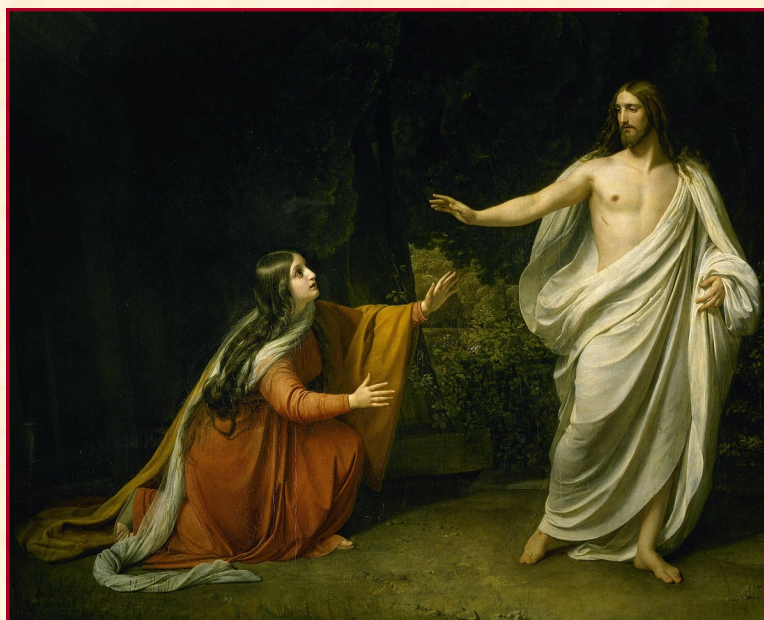
Christ's Appearance to Mary Magdalene after the Resurrection