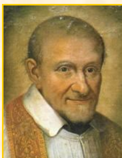
Portrait de Saint Vincent de Paul. Toile de l'glise paroissiale de Clichy.

The Gospel today is a great example of saying, "actions speak louder than words."