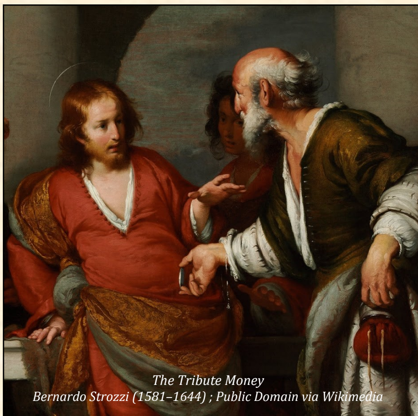
The Tribute Money

Bernardo Strozzi (1581-1644)