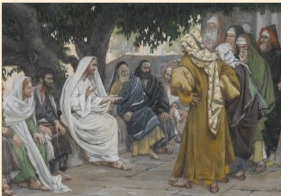
Jesus speaks to the Pharisees - Gesù parla ai farisei James Tissot, (1886-1894)

145 Glen Avenue, Sea Cliff, NY 11579 516-676-0676; stbonchurch@gmail.com www.saintboniface.org www.facebook.com/StBonifaceMartyr/