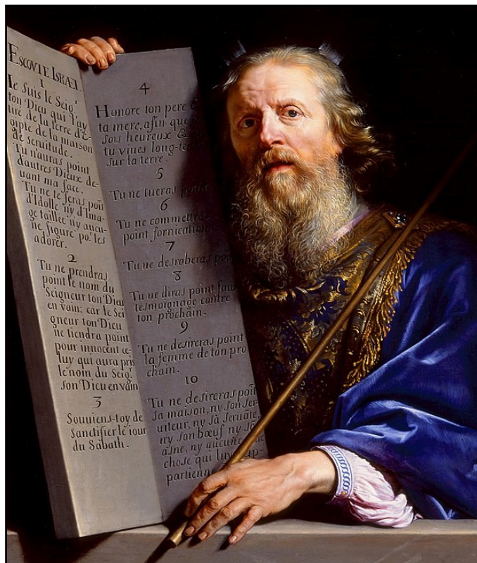
MOSES PRESENTING THE TABLETS OF THE LAW

Lectionary Bulletin Inserts: Reflections on the First and Second Readings, Year A © 2019 Archdiocese of Chicago: Liturgy Training Publications. All rights reserved. Written by Paul Turner. Lectionary for Mass © 2001, CCD