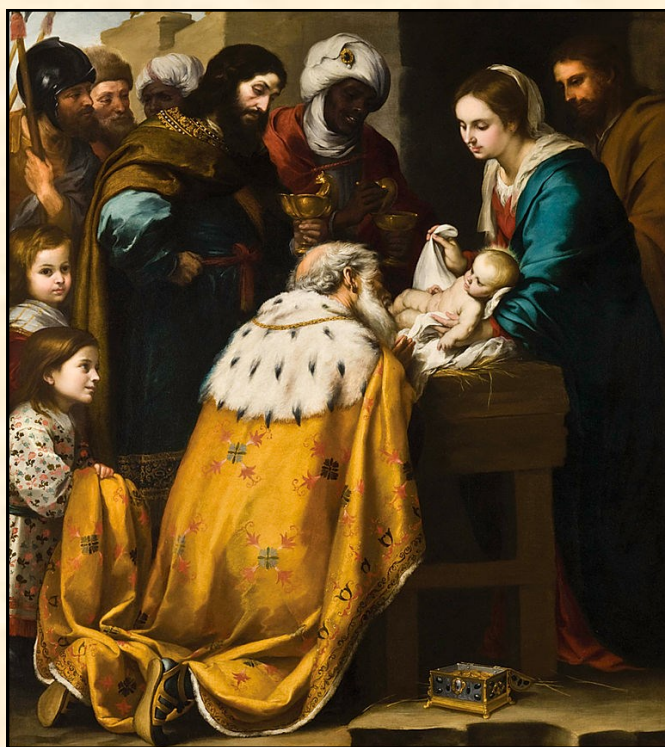
Adoration of the Magi. Bartolomé Esteban Murillo

145 Glen Avenue, Sea Cliff, NY 11579 516-676-0676; stbonchurch@gmail.com www.saintboniface.org www.facebook.com/StBonifaceMartyr/