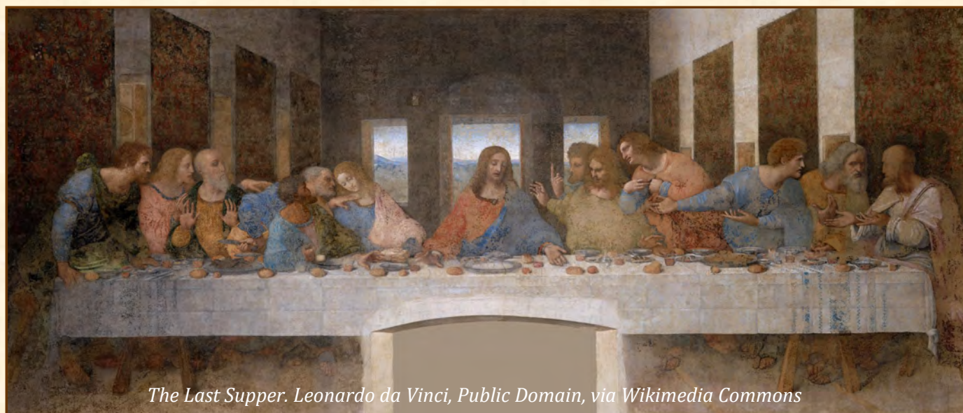
The Last Supper. Leonardo da Vinci