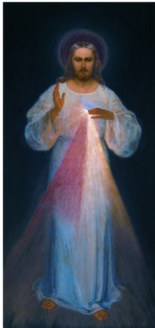
Image: Divine Mercy, Eugeniusz Kazimirowski, 1934.

"You expired, Jesus, but the source of life gushed forth for souls, and the ocean of mercy opened up for the whole world. O Fount of Life, unfathomable Divine Mercy, envelop the whole world and empty Yourself out upon us. Jesus, I trust in You."