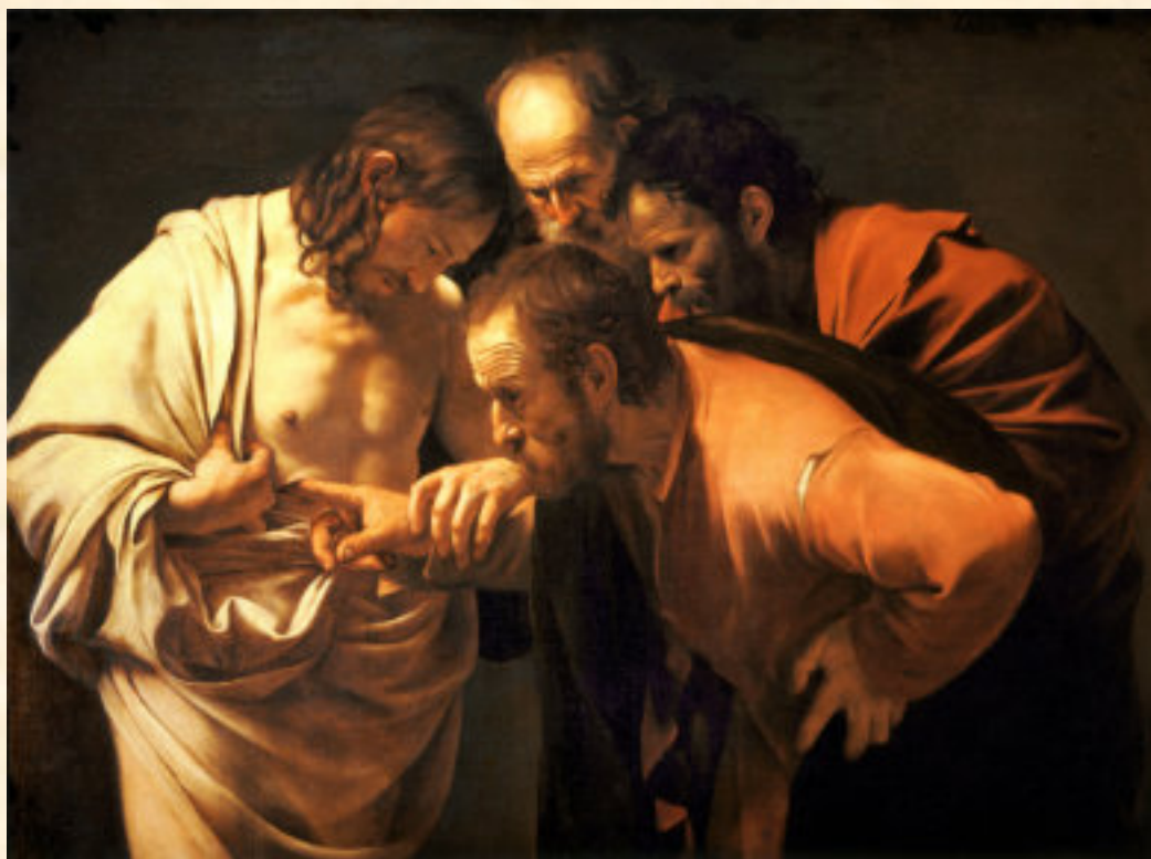
The Incredulity of Saint Thomas. Caravaggio, 1601-2.

Second Sunday of Easter (Divine Mercy Sunday): April 12, 2026