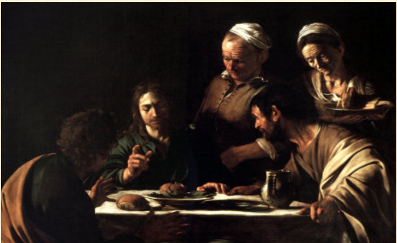
Supper at Emmaus. Caravaggio, circa 1606.