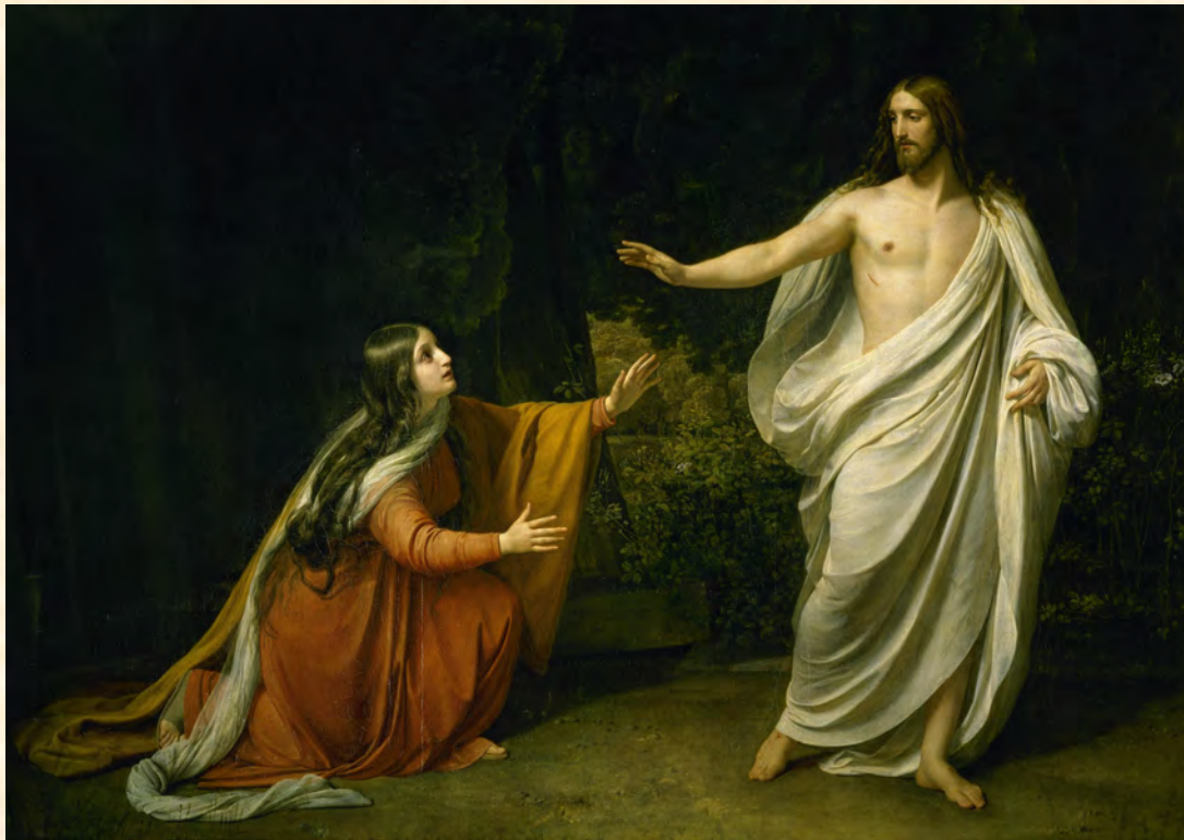
Christ's Appearance to Mary Magdalene after the Resurrection, Alexander Ivanov, 1835.

Russian Museum.