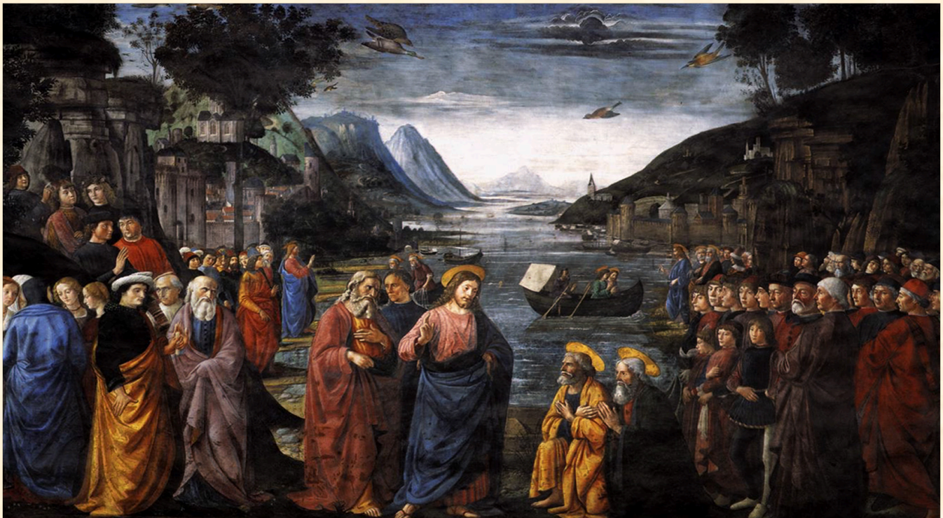
Calling of the First Apostles. Domenico Ghirlandaio, 1481.

"Jesus sent out these twelve after instructing them...As you go, make this proclamation: 'The kingdom of heaven is at hand. Cure the sick, raise the dead, cleanse lepers, drive out demons. Without cost you have received; without cost you are to give.'" Matthew 10:5-8.