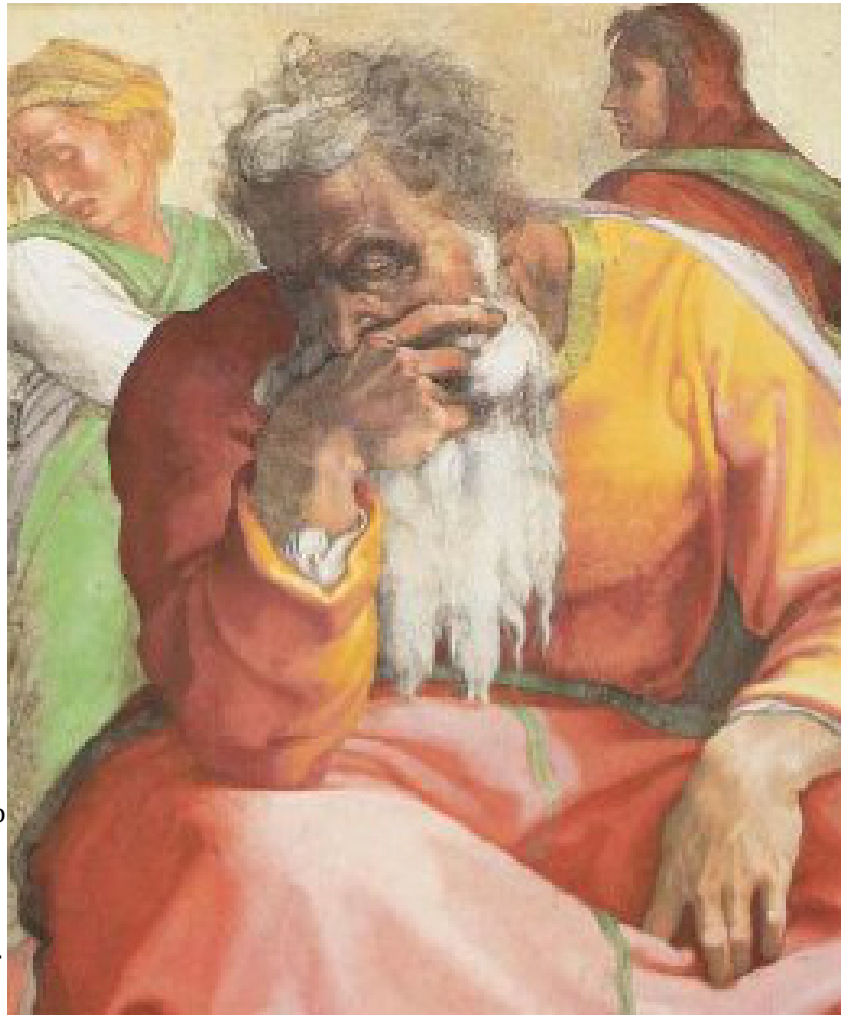
Jeremiah (detail). Michelangelo.

Human beings fail. Our best efforts may fall short. Our ability to make and sustain friendships may falter. But God's love will never cease. It will provide a sure foundation when the protective walls of friendship crack