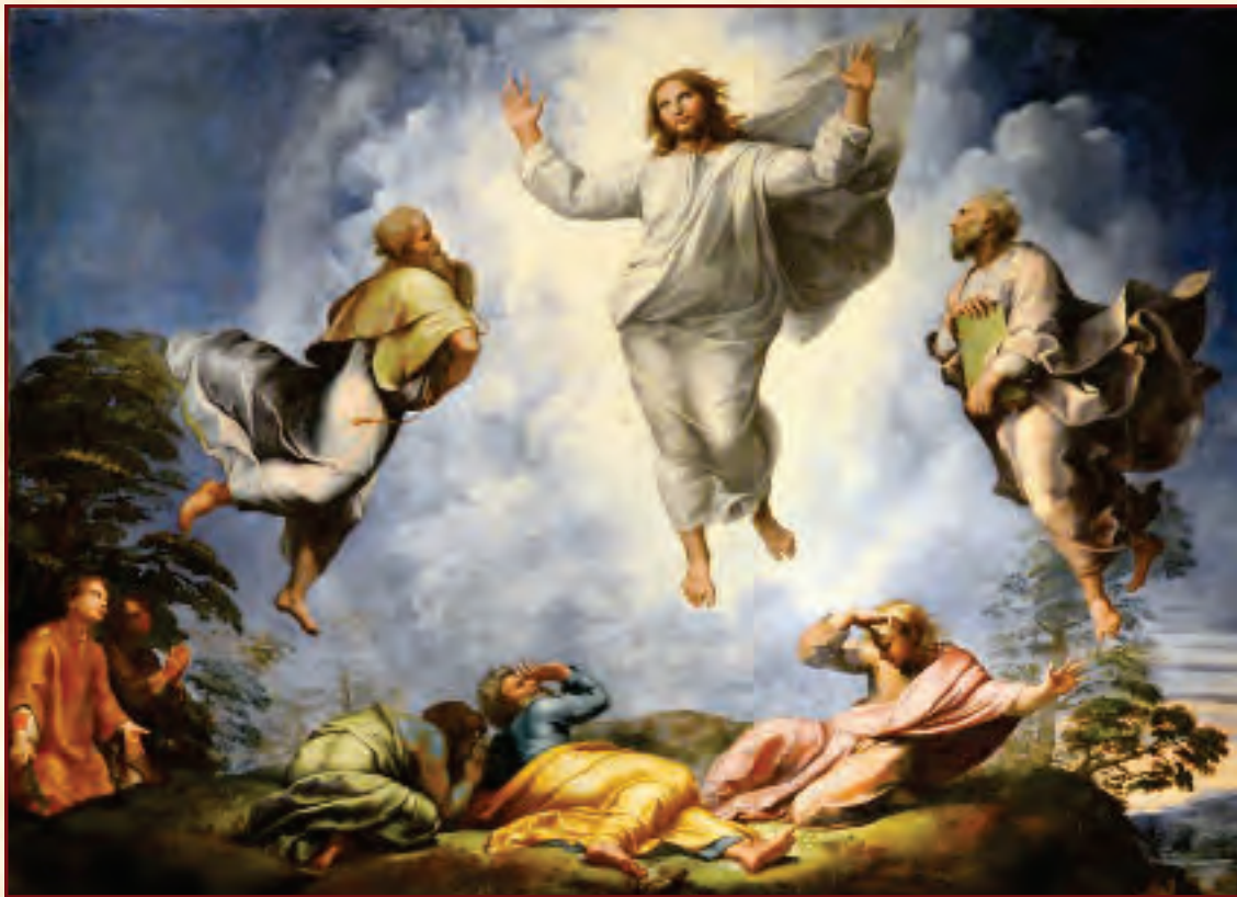
The Transfiguration. Raphael, 1517-20.