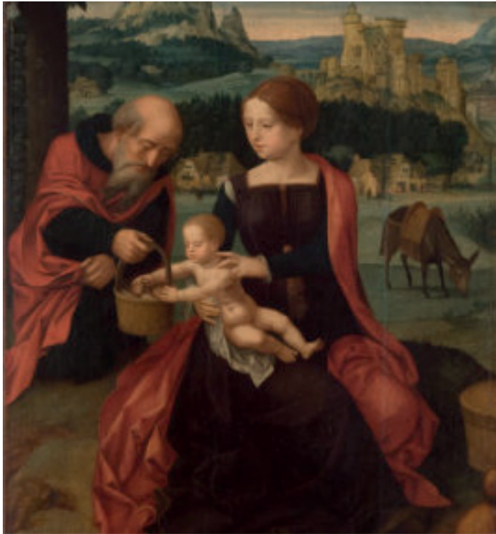
Master of the Female Half-Lengths, circa 1520-1540

Of all the men in Israel that the Father in Heaven could have chosen to be Jesus' foster father, He chose Joseph of Nazareth, a carpenter. His solemnity on March 19 honors Joseph and points us to his marital union with the Blessed Virgin Mary and the effect that their marriage had not only on the Holy Family, but also upon us as members of the Body of Christ.