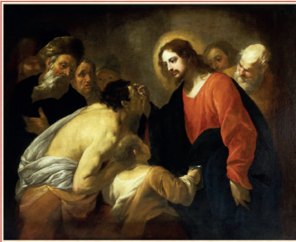
Healing of the Man Born Blind. Orazio de Ferrari, 17th Century.

Fourth Sunday of Lent: Laetare Sunday ~ March 15, 2026