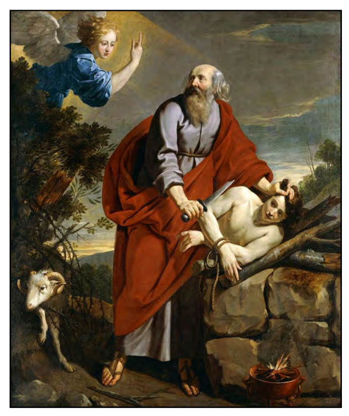
Le sacrifice d'Isaac; Philippe de Champaigne, 1927.