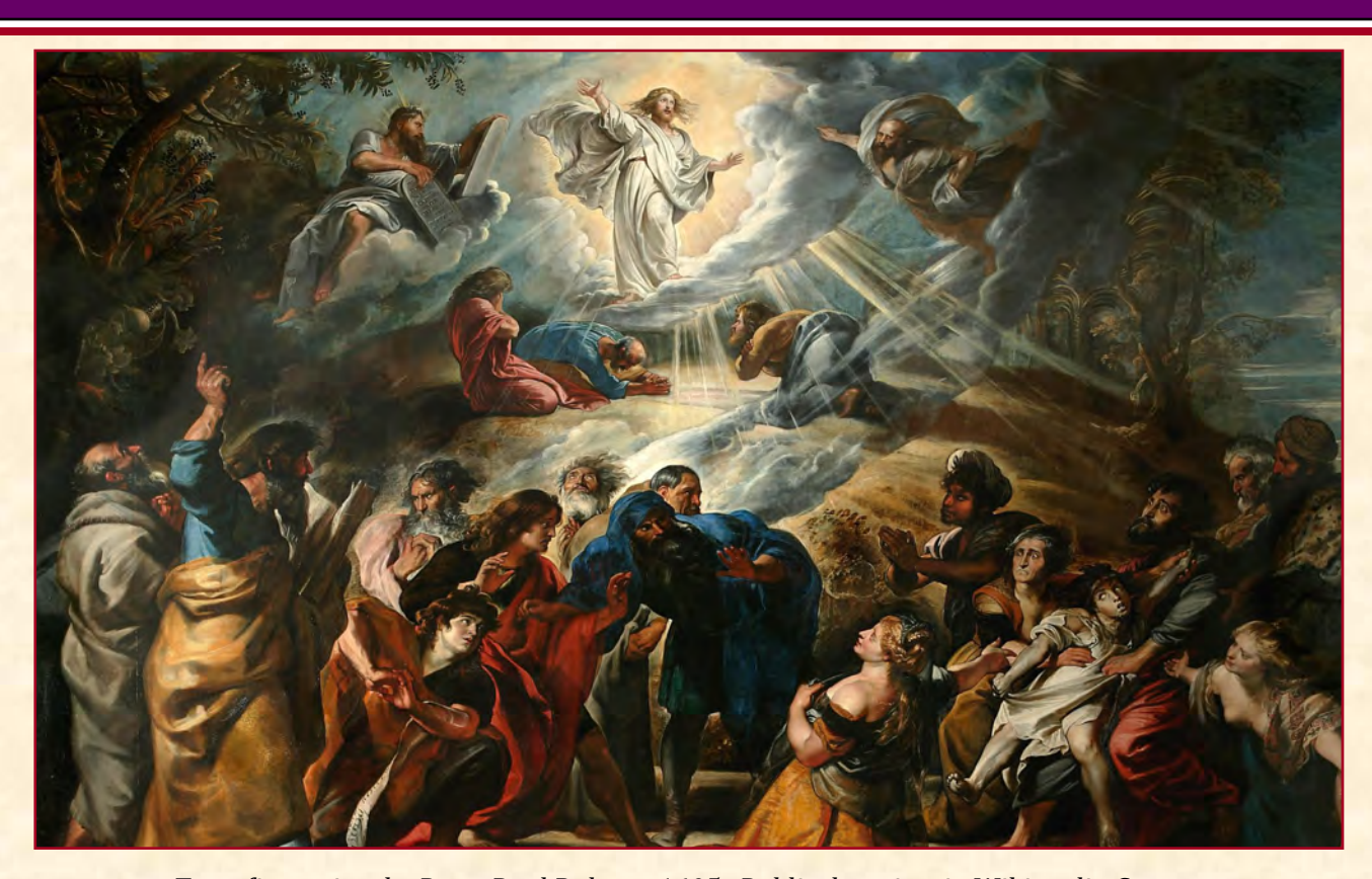
Transfiguration, by Peter Paul Rubens; 1605.