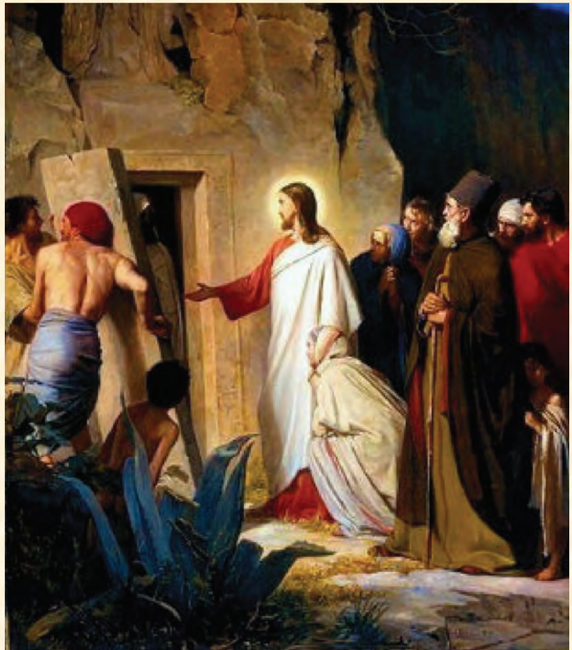
Raising of Lazarus, Carl Bloch, 1870s.

145 Glen Avenue Sea Cliff, NY 11579 516-676-0676 www.saintboniface.org stbonchurch@gmail.com www.facebook.com/StBonifaceMartyr/