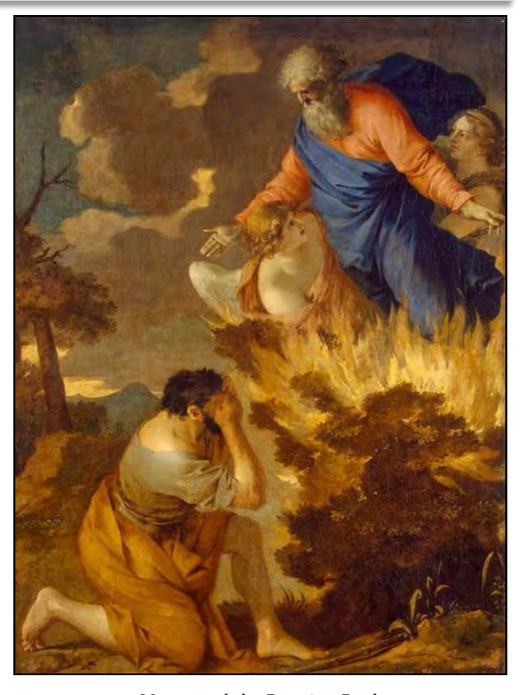
Moses and the Burning Bush Bourdon Sebastien, 1616-71.

God promises Moses, "I will stand in front of you on the rock." Moses strikes that rock, and water gushes forth.