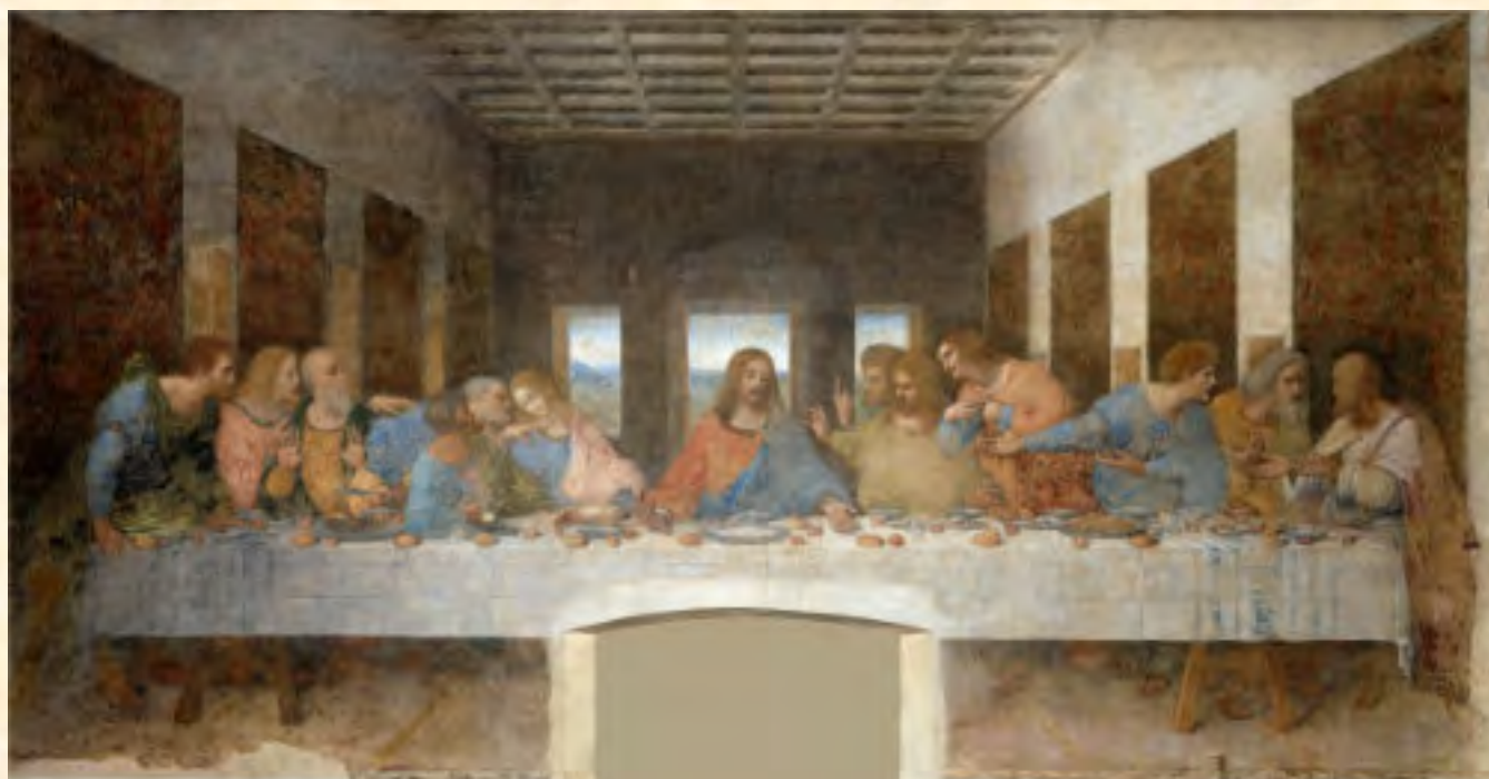
The Last Supper, Leonardo da Vinci, 1452-1519.