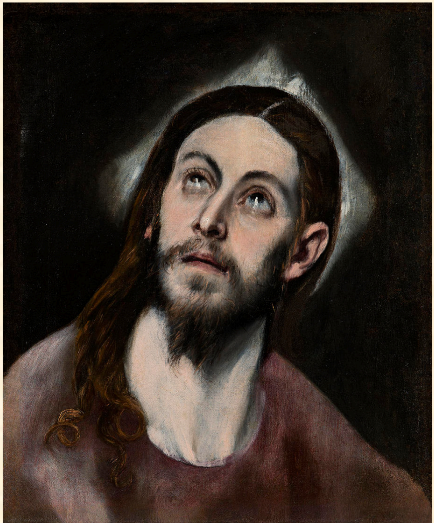
Image: Head of Christ El Greco, 1579.

Jesus raised his eyes to heaven and said, "Father, the hour has come. Give glory to your son, so that your son may glorify you..." - John 17:1-2