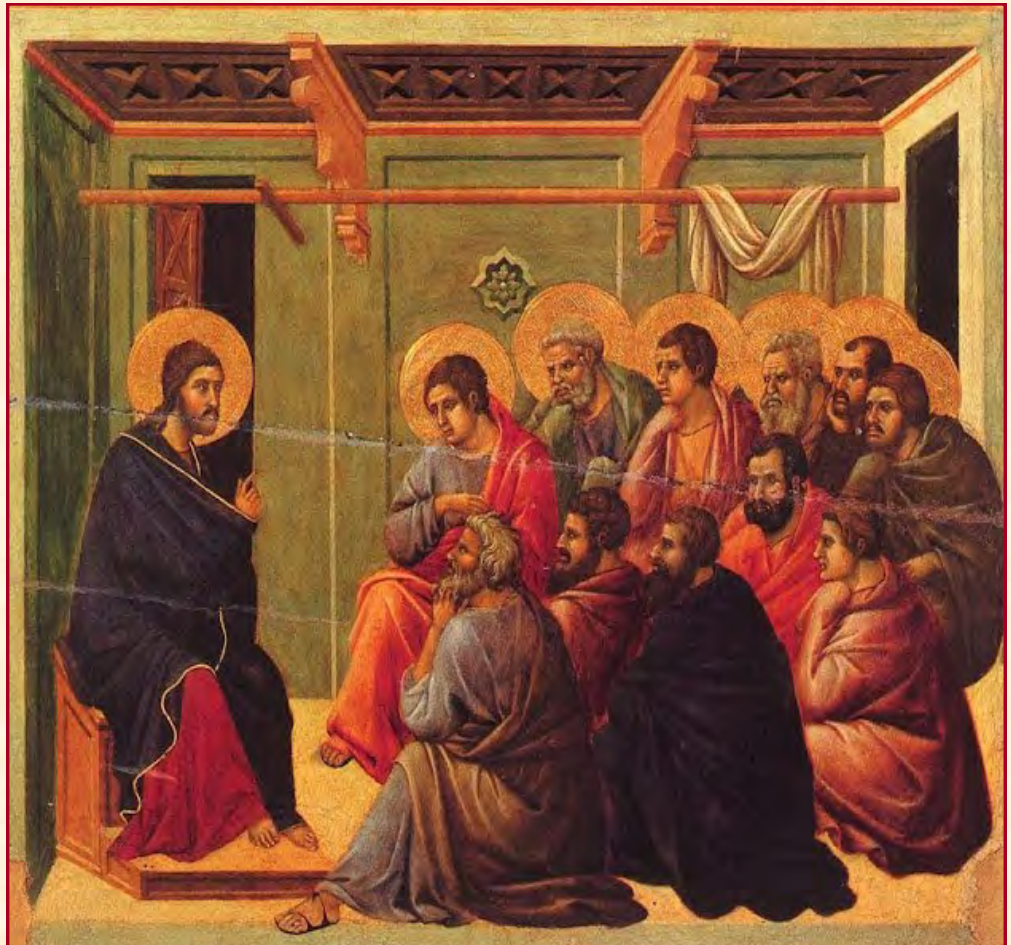
Christ Taking Leave of the Apostles

145 Glen Avenue Sea Cliff, NY 11579 516-676-0676. www.saintboniface.org ; stbonchurch@gmail.com www.facebook.com/ StBonifaceMartyr/