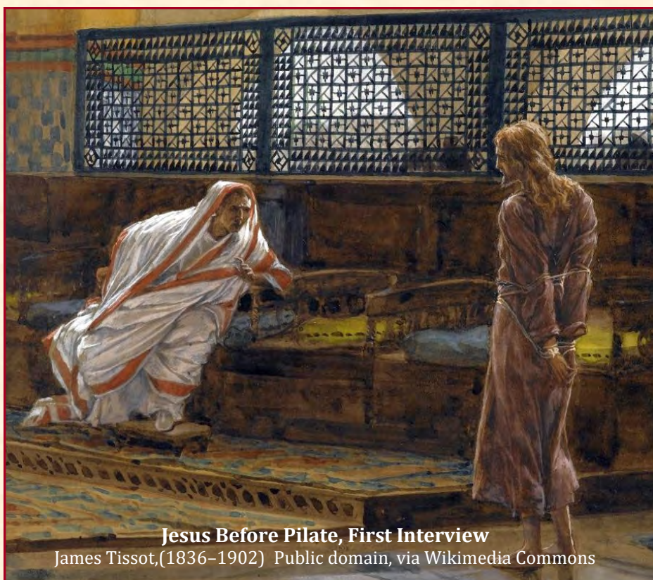
Jesus Before Pilate, First Interview

Tuesdays through Thursdays: 9am-12pm; 12:30-3pm